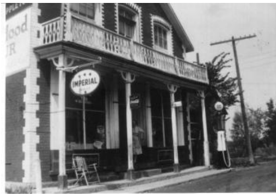
Late 1940s, Courtesy of Trisha Stewart http://www.virtualmuseum.ca/sgc-cms/histoires_de_chez_nous-community_stories/pm_v2.php?id=record_detail&fl=0&lg=English&ex=00000835&rd=248191