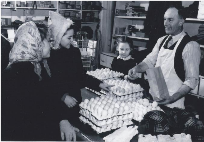
Lyons General Store (1939-c1949) by Malak Karsh, courtesy of https://lindaseccaspina.wordpress.com/2015/10/22/the-appleton-general-store-and-polly-parrott/