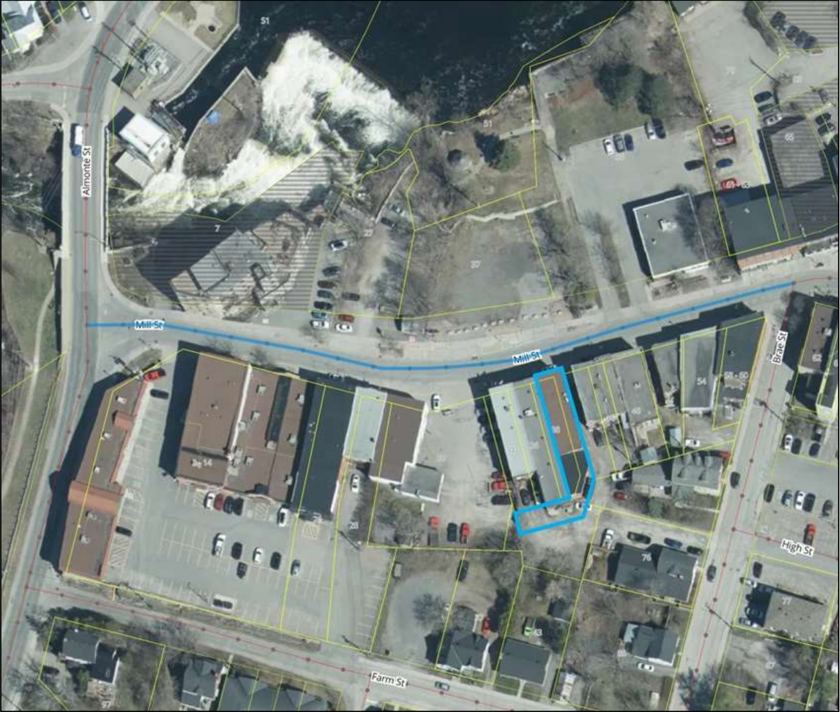
Figure 1: Subject Lands

Figure 1 below shows an aerial image of the subject property.