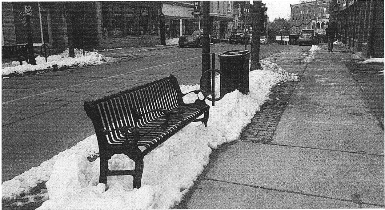
Sign would be installed near the corner of upper Mill Street.