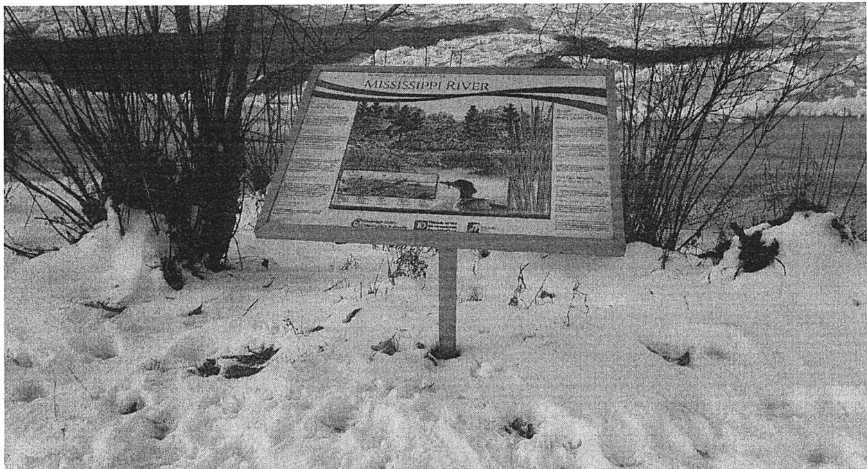
Structure proposed would be in line with this model in the Metcalf Geoheritage Park in Almonte.