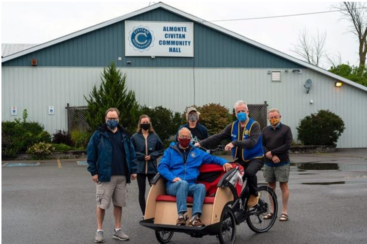
Trio Bike Delivery by the Almonte Civitan Club

One trio bike was paid for by the Almonte Civitan Club and the other by citizen-fundraising. Look for the trio bikes at all outdoor community events this summer and up and down the OVRT!