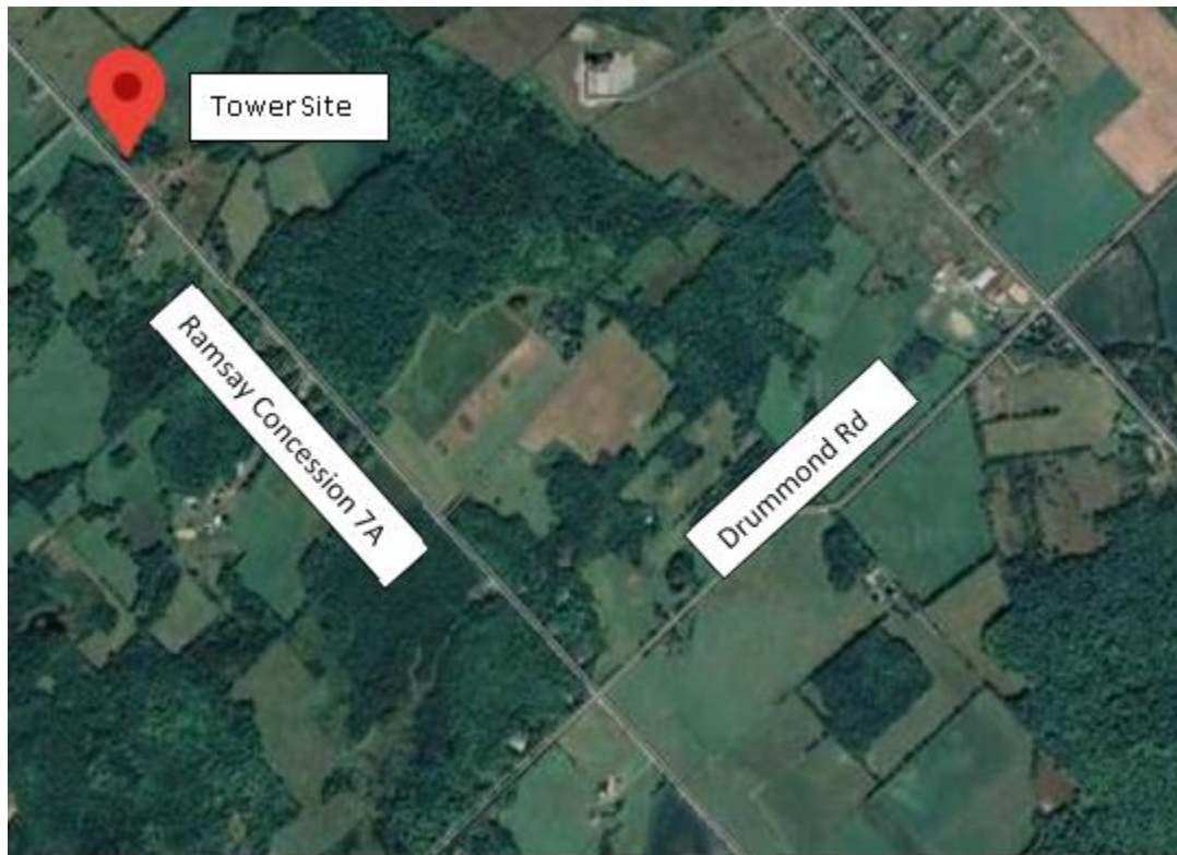
Figure 1 – Context Map

The proposed installation is a lite duty self support style communications structure. The tower installation is a triangular structure and will be 45m in height and occupy a footprint of approximately 3 metres by 3 metres. The tower will have an anti-climb mechanism. Transmitting and receiving antenna equipment is mounted to the upper portion of the structure as well as provisions for future technology services.