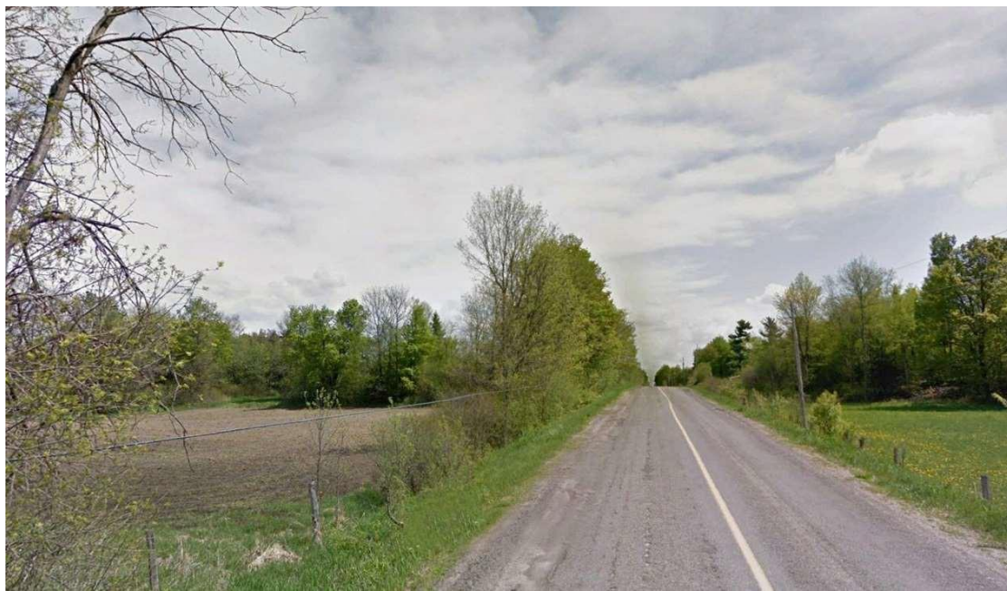
Figure 2 Ramsay Concession 7A BEFORE installation

The proposed installation is a lite duty self support style communications structure. The tower installation is a triangular structure and will be 45m in height and occupy a footprint of approximately 3 metres by 3 metres. The tower will have an anti-climb mechanism. Transmitting and receiving antenna equipment is mounted to the upper portion of the structure as well as provisions for future technology services.