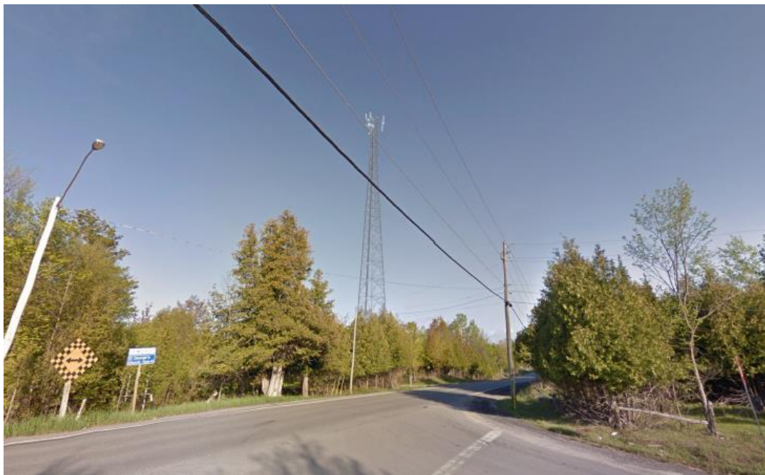
Figure 2 – Conceptual Rendering looking west from Clayton Rd at Tatlock Rd

The installation will be 75m self-support tower and an ancillary equipment structure surrounded by chain-link fencing.